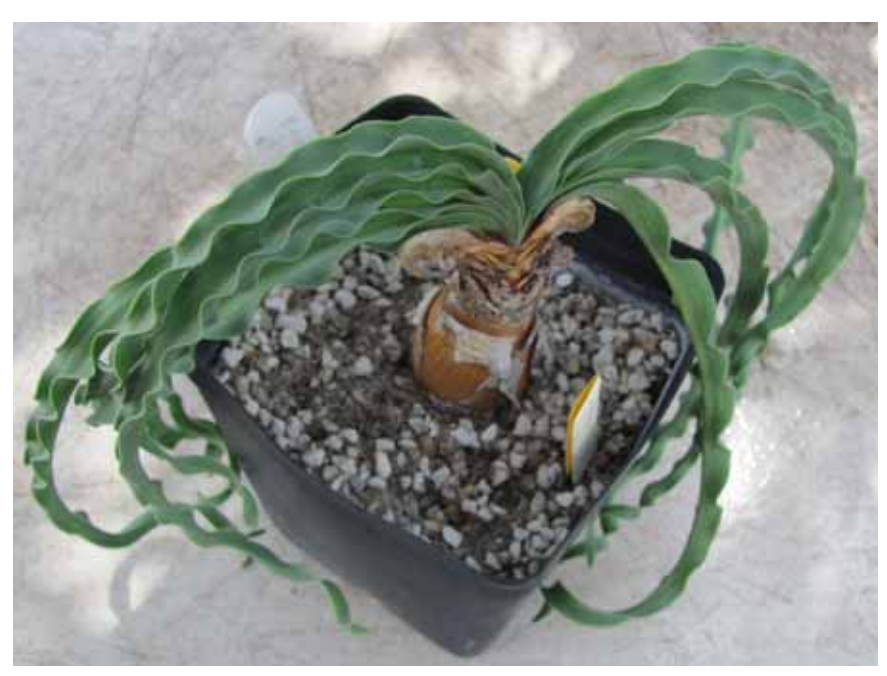
Boophane disticha growing in sandy pumice mix at the Arboretum.