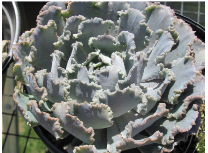
Echeveria "Madre del Sur"

ages, particularly on Sunday. We had a wonderful and profitable sale and an enjoyable weekend.