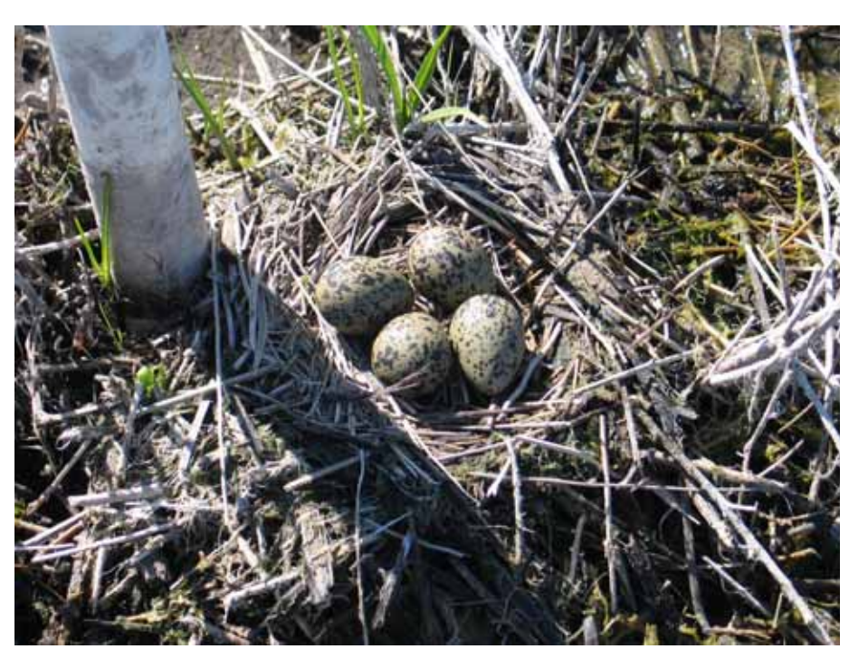
A Black-Necked Stilt nest in the Marsh this spring.