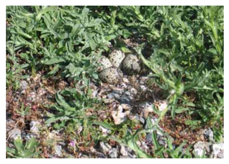
Above, Killdeer eggs in a nest at the Marsh. Right, a Black-Necked Stilt sitting on a nest built of coastal bulrush stems.

at http://www.seaandsageaudubon.org/BirdInfo/BirdCounts/SJWScensus/SJWScensus.htm and at Upper Newport Bay: http://www.seaandsageaudubon.org/BirdInfo/BirdCounts/UNBcensus/UNBcensus.html