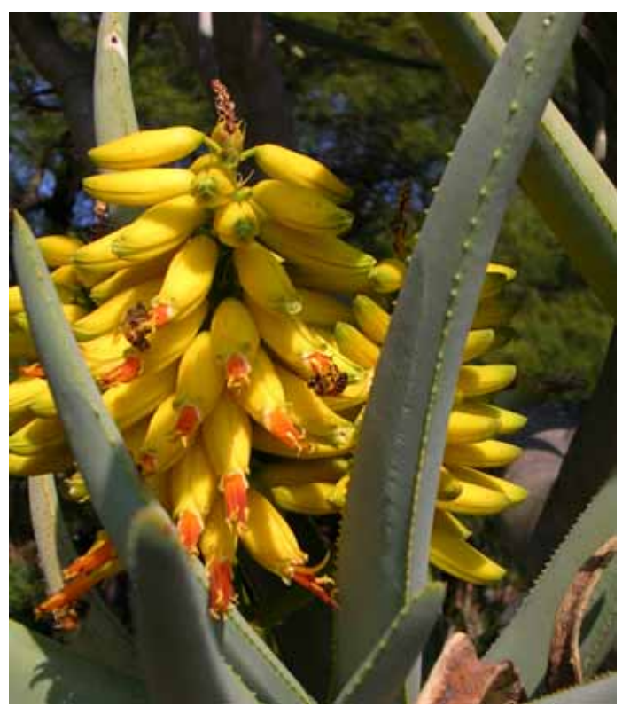
Aloe dichotoma